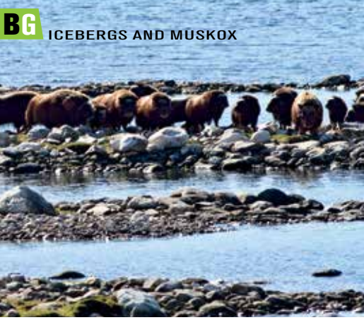
My estimated 700-plus pound bull, shown here being protected by the rest of the herd, fell within 25 yards of the seashore, making it way too easy to quarter and haul the meat back to camp on the boat.

The bull ran about 100 yards and stopped. Then, in a defensive behavior that's uncommon in the rest of the animal kingdom, the other muskox huddled around the bull to protect him. Once again, we used the willows as cover and stalked to within 20 yards of the group. After waiting for him to clear the other animals, I placed another arrow through both lungs. The bull took off, but this time he didn't go far.